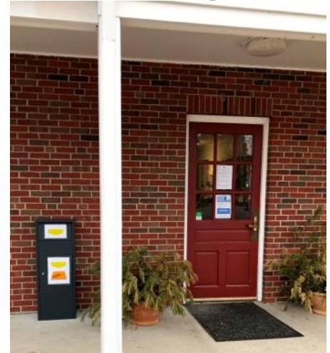
Town Hall Drop Box