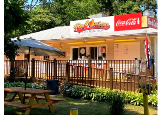
A New Location for Red Onion Pizza

The past few months have been challenging for not only our residents, but local businesses as well. Since March, EDC has worked hard to support and promote North Stonington businesses. We have offered advertising to promote our local businesses throughout the region. Planning and Zoning has worked with us to allow more temporary signage, so that businesses that were open could be more visible to the public. EDC worked with local farmers and the Shunock River Brewery to offer locally grown and sourced products to our residents in one place, at the “Village Co-op”. We hope something will sprout out of the seed planted by this initiative.