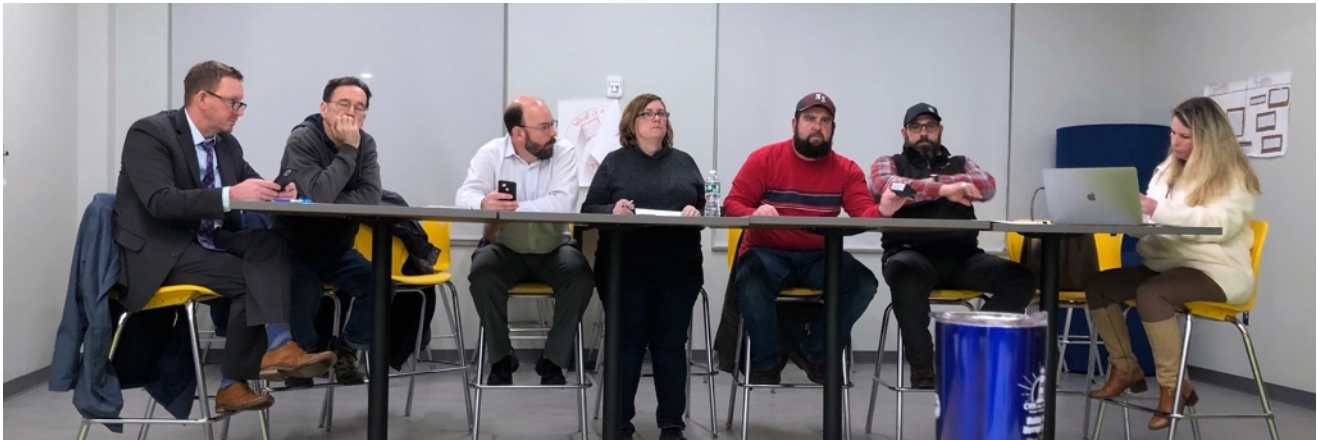
Members of the School Modernization Building Committee at Work